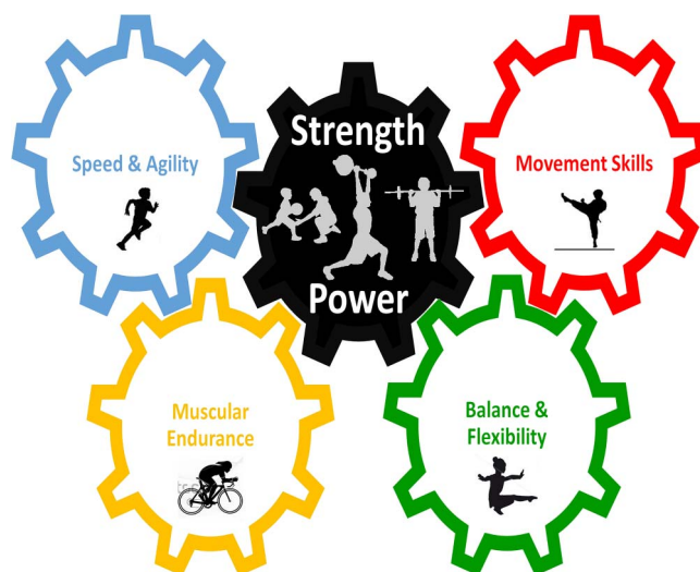
Figure 1 The driving influence of strength and power on parameters of athletic performance.

Enhancing the physical literacy of youth to improve athletic prowess is not a novel concept. 44 However, an evidence-based approach to long-term physical development must include resistance training given its proven performance enhancing benefits. 1 4 43 In addition to enhancing muscular strength, regular participation in a progressive resistance training programme for 2 years improved sprint speed up to 6% in elite youth soccer players compared to a group of age-matched players who participated only in regular soccer training. 45 Others reported favourable changes in performance measures in age-group swimmers, 46 preadolescent rhythmic gymnasts, 47 and adolescent basketball, 48 handball 49 and tennis players 11 following resistance training. Of potential relevance is that researchers monitored strength performance on the front and back squat exercises in 141 elite youth soccer players over 2 years and determined possible reference values in strength performance for these athletes. 50 These researchers suggested that relative strength (ie, 1 repetition maximum (RM)/body weight) in parallel squat performance for young soccer players and other athletes with resistance training experience should range from 0.7 for 11 to 12-year olds, 1.5 for 13 to 15-year olds, and 2.0 for 16 to